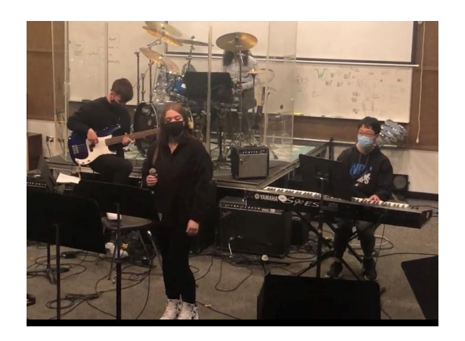
"Battle of the Bands" Facey General Music vs. Hunting Hills