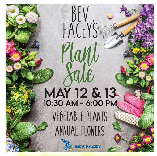
Bev Facey "Plant Sale" - Huge Success!