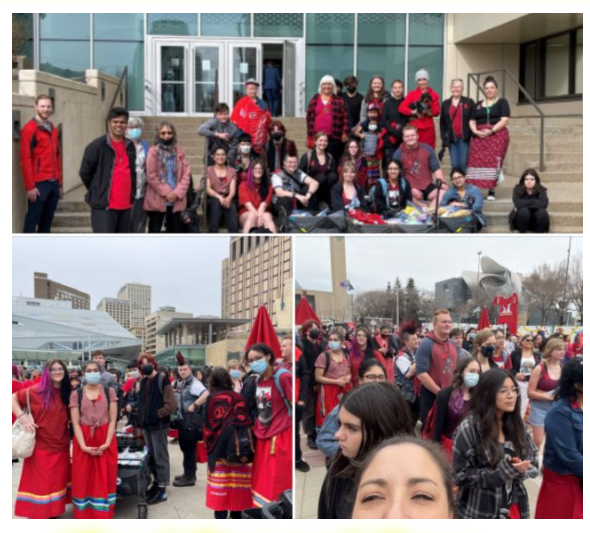
"Red Dress" Day