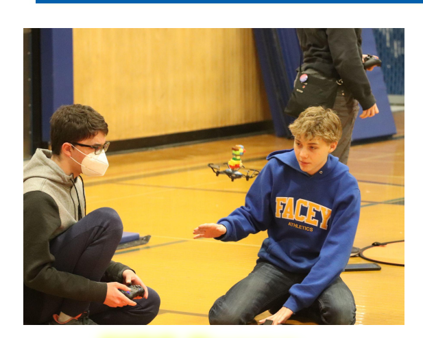
EIPS Drone Camp

Bev Facey Bright Spots - April and May Contd.