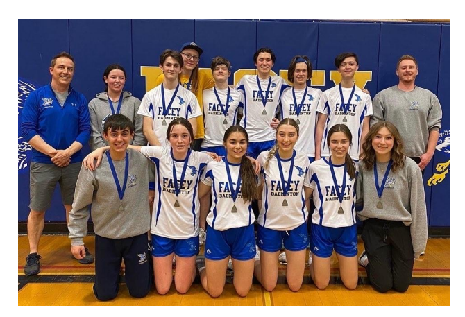
Badminton - Silver!