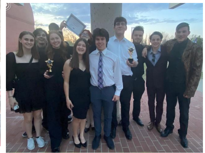
"One Act" Provincial Champs