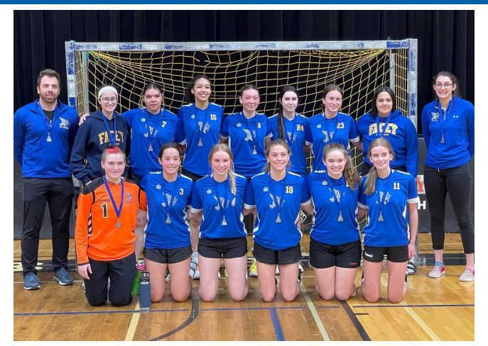
Handball -4th at Provincials